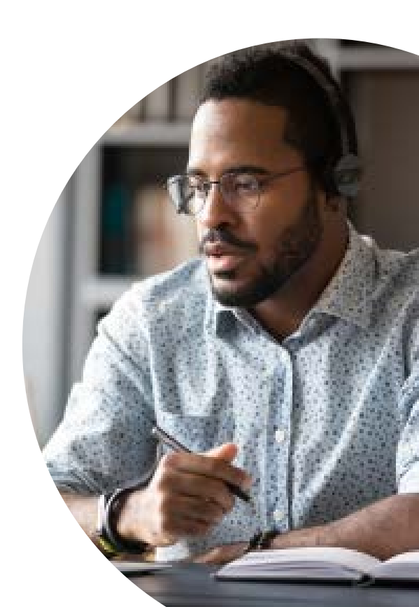
37% would turn to a support organisation like caba

45% Almost half would turn to their partner